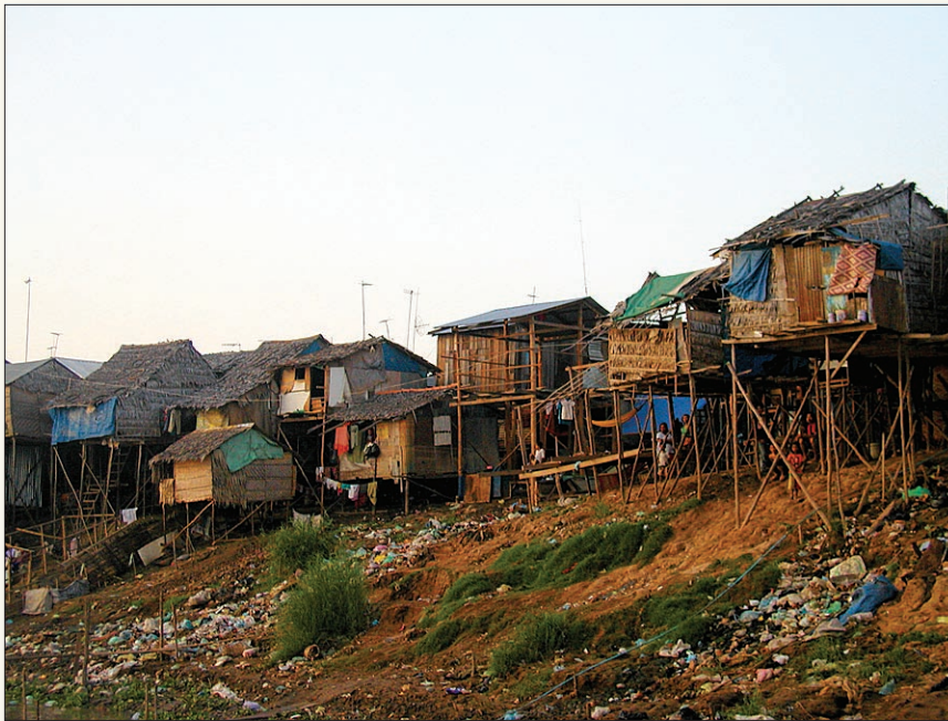
Figure 1.4: An informal settlement in Vietnam is an example of the types of challenges posed by an LAS that develops informally.